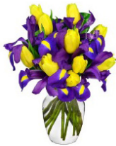
Altar Flowers have been anonymously donated in honor of Jesus in the Holy Eucharist.

If you did not turn in your stewardship form or did not receive one , there is still time to do so. Extra forms are located on the table in the back of church. These can be placed in the offertory basket or sent to the Parish Office. You may also complete a Stewardship Form online at the parish website. The form is under the Resources tab, Volunteering section.