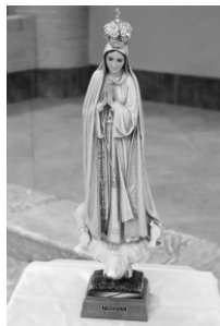
Pilgrim Virgin Statue of Our Lady of Fatima Schedule