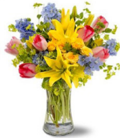
The Altar Flowers are Dedicated in Honor of Jesus in the Holy Eucharist.