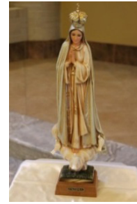
Pilgrim Virgin Statue of Our Lady of Fatima Schedule

Do you donate clothes to Goodwill? At St. Vincent de Paul we sometimes have clients who need new clothes, and we are able to give them vouchers to buy them at Goodwill. If you or anyone you know donates a large bag of clothing to Goodwill, and fills out the donation form with our name on it (St. Peters St. Vincent de Paul), we will get a credit toward the vouchers that we give out. Your donation to Goodwill helps that organization, and in this way it will also help our own St. Vincent de Paul. Thank you for considering this.